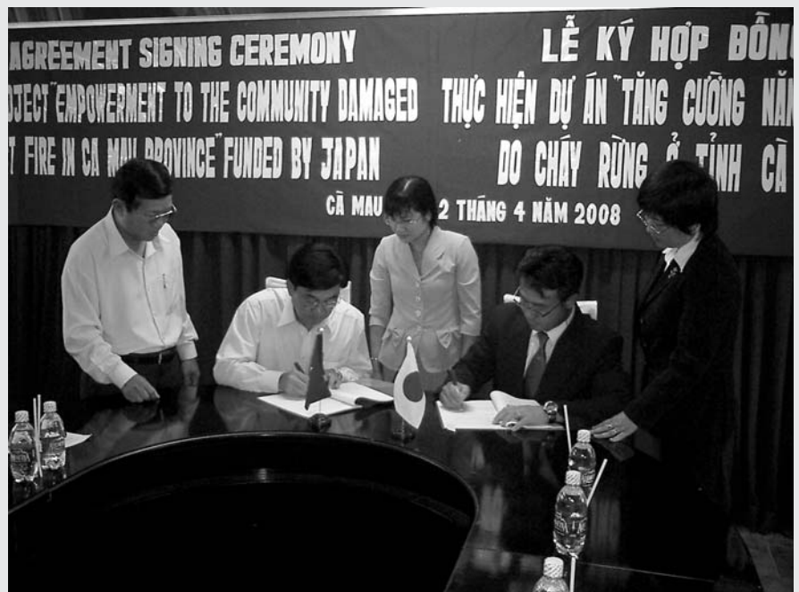
Signing a procurement agent contract on grant aid for a community empowerment project (Vietnam)

*Total may differ from results of calculation due to rounding.