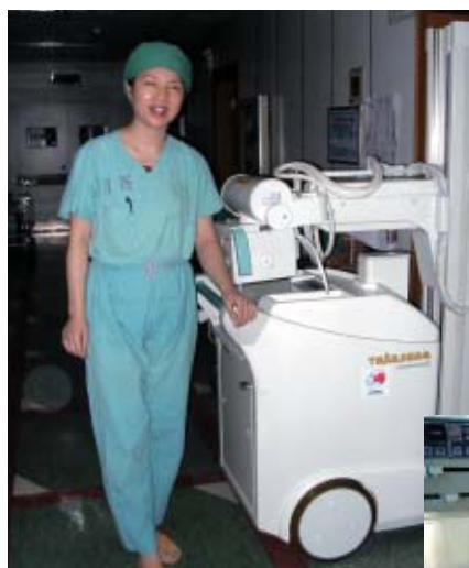
Portable X-ray equipment used at the Anhui Provincial Hospital

On May 31, Chinese President Hu Jin Tao, attending ceremonies marking the 300th anniversary of the founding of St. Petersburg, expressed "heartfelt thanks to Japan for its SARS-related support, on behalf of the Chinese people and government." Health officials in Anhui Province released this comment: "The Japanese people showed interest in our fight to contain SARS at a vital time. We would like to express the gratitude of the Chinese people not only to the Japanese government but to all Japanese people as well."