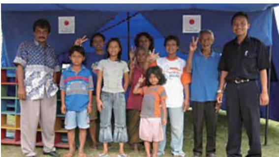
Affected family using a tent provided by Japan

Philippines: Emergency Grant Aid for the Mudslides Disaster caused by Typhoon "Reming" in Southern Luzon Island (FY2006)