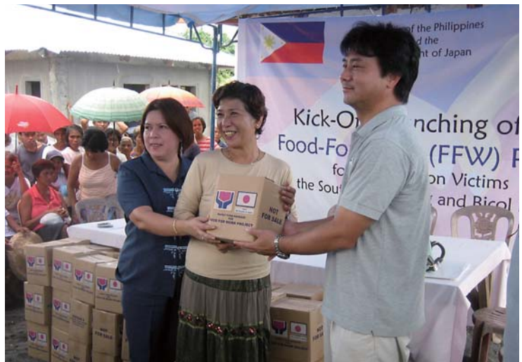
Handover ceremony for food packs