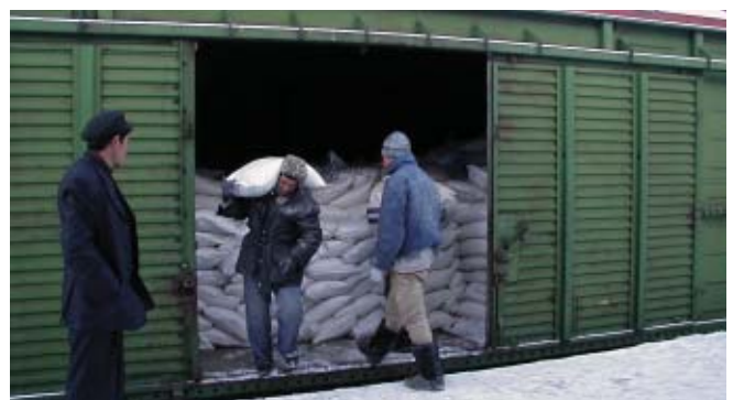
Mongolia Rice and wheat procured to feed the nomadic population (FY2000 project)