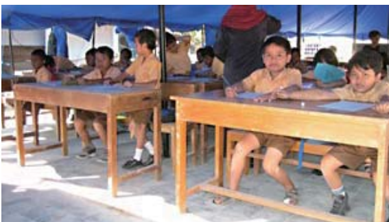
Children taking a class under a large tent provided by Japan

Indonesia: Emergency Grant Aid for the Area Affected by the Earthquake in Yogyakarta and Central Java (FY2006)