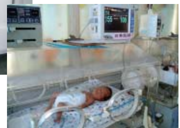
ICU monitor set and fluid infusion pump installed at the Hefei Municipal Children's Hospital, Anhui Province