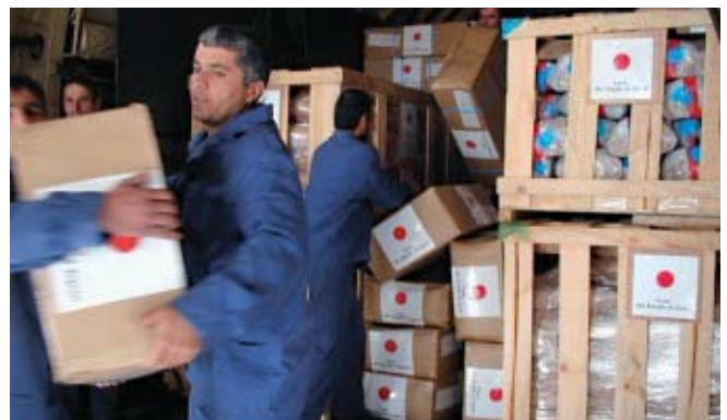
Tajikistan Tents and blankets for refugees are unloaded from a chartered aircraft (FY2001 project)

Emergency grant aid literally requires prompt action. In its role as a procurement management agent, JICS contributes to assisting people affected by natural disasters, and civil war or other man-made disasters.