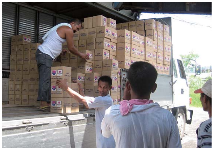
People unloading food packs procured using ODA funds from Japan. These food packs were used for the Food for Work Project implemented by the local government.

Philippines: Emergency Grant Aid for the Mudslides Disaster caused by Typhoon "Reming" in Southern Luzon Island (FY2006)