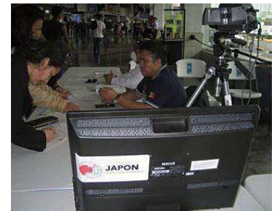
Thermographs and other equipment in use at the North Bus Terminal in Mexico City

JICS, after signing an Agent Agreement with the Mexican Embassy in Japan on May 3, 2009 regarding procurement of thermographs, implemented procurement procedures, managed the funds provided, and delivered the thermographs and peripheral equipment to Mexico City International Airport on May 7.