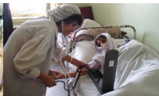
Afghanistan Sphygmomanometer in use at a hospital in Kabul (FY2001 project)