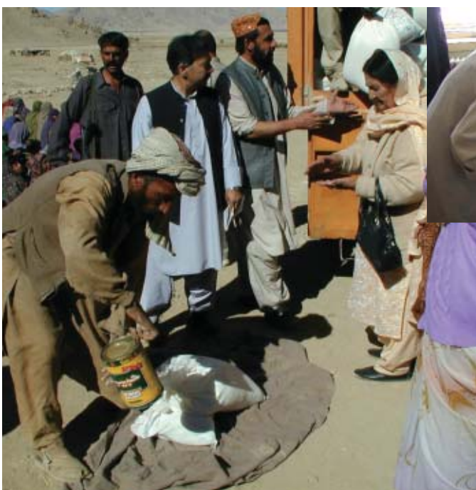
Pakistan Drought-affected residents welcome the distribution of aid supplies (FY2000 project)