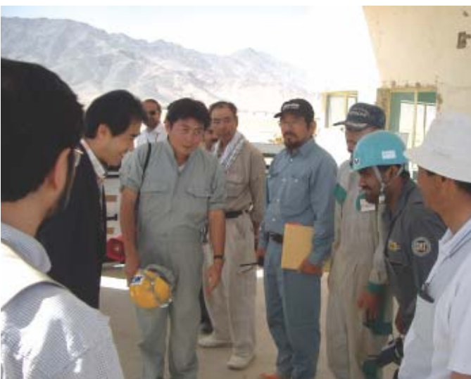
The Research Project for Developing Mine Clearance-related Equipment in Afghanistan

Afghan officials in Japan to inspect prototype demining equipment