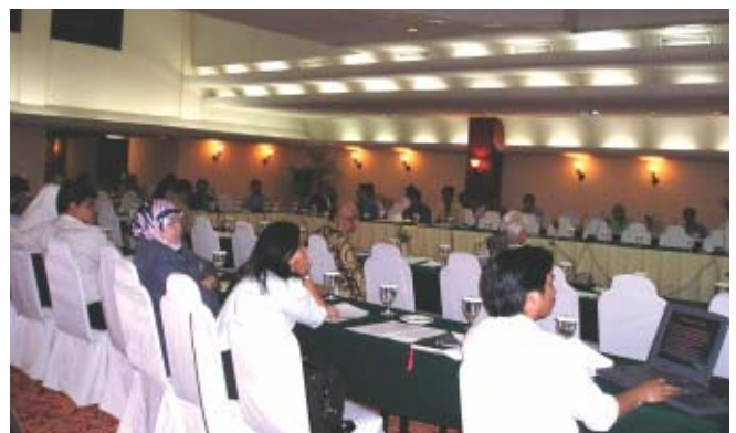
The Project for Research on Decentralization of the Republic of Indonesia (Phase 2) Exit workshop held in Bandung, Indonesia

Afghan officials being introduced to Mr. Ichiro Aisawa, Japan's Senior Vice-Minister for Foreign Affairs, who was inspecting the test site