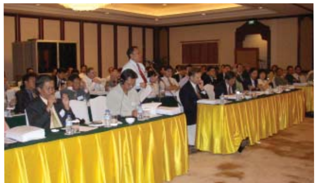
Exit symposium held in Jakarta. Following researchers' presentations, participants had lively discussions.

The symposiums and workshops were attended by participants from the central and local governments, international organizations, NGOs, universities and other groups, and the media, and the proceedings stimulated lively discussion. The reports presented by the Japanese and Indonesian researchers to the Indonesian central government also included recommendations concerning decentralization policies. Those recommendations were compiled, in Indonesian and English, in a booklet that was distributed to regional government officials and others.