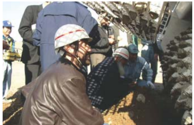
The Research Project for Developing Mechanical Demining Machines in Afghanistan

Local staff setting up explosives under mine-clearing equipment to test explosion resistance