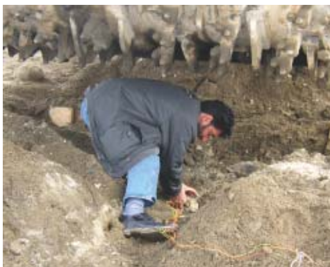
The Research Project for Developing Mine Clearance-related Equipment in Afghanistan

Since FY2001, in accordance with contracts with the governments of developing countries, JICS has been managing grant aid provided for research and development activities, and offering coordination and support to ensure that activities among researchers and manufacturers in Japan and developing countries are carried out smoothly.