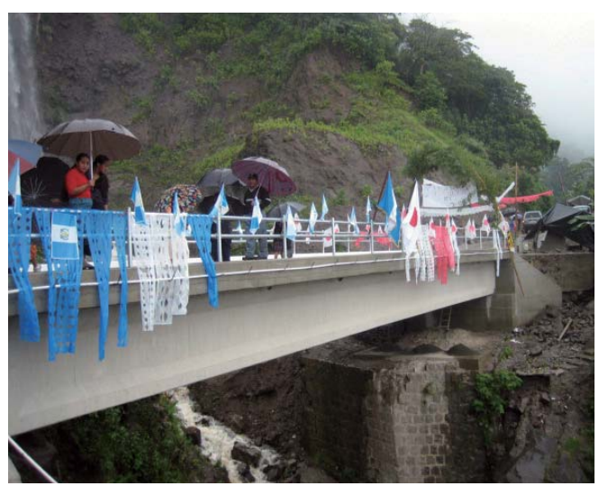
Guatemala Opening ceremony for the rebuilt Barrancas Bridge damaged during Hurricane Stan