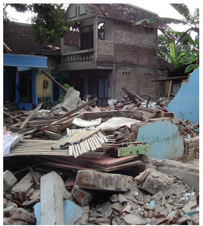
Indonesia A building damaged in the earthquake that struck central Java

Since fiscal 2006, when this grant aid program began, JICS has been mainly involved in managing implementation of projects for reconstruction after natural disasters. While grant aid for disaster prevention and reconstruction is needed quickly, many structures and facilities are in need of reconstruction, and therefore strong procurement management expertise and knowledge of many different areas are needed. As a procurement management agency, JICS supports the smooth and effective implementation of grant aid.