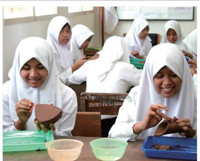
Indonesia Children studying at reconstructed Pleret No. 2 Junior High School