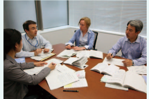
Review session at JICS Headquarters

JICS performs the primary check of these documents to examine whether they are appropriately prepared by the Borrowers, i.e. whether the documents are in compliance with JICA Guidelines.