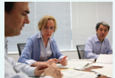
Primary Check for Procurement-related Documents: Review session at JICS Headquarters