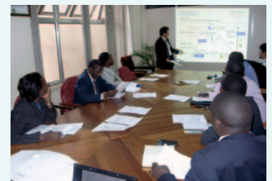
Facilitation of Executing ODA Loan Projects: Explanation of disbursement in Uganda