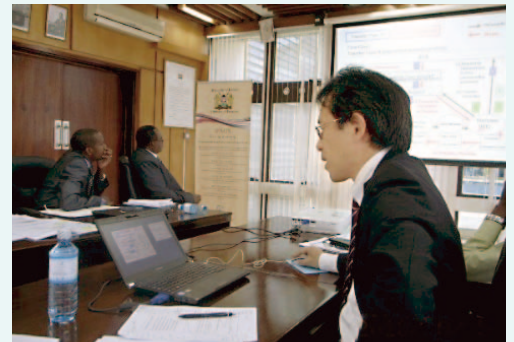
Presentation of disbursement method in Kenya

JICS has dispatched experts for the facilitation of projects to Uzbekistan in 2012 and countries in Sub-Saharan Africa in 2013 under contract with JICA.