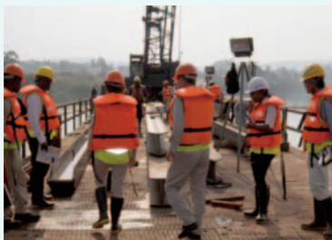
Ex-post Procurement Audit: Visit to Project Site in Uganda