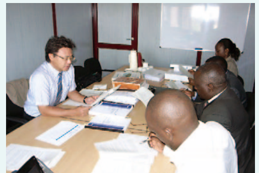
On-site audit in Kenya

JICS has conducted several Ex-post Procurement audit works under contract with JICA. While most of the Ex-post Procurement Audit is conducted in Japan, on-site audits are implemented for selected projects. Results of the audit, issues and weaknesses in the procurement procedures are reported to JICA.