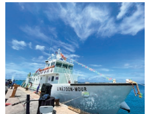
Medical vessel with onboard consultation and treatment for Marshall Islands