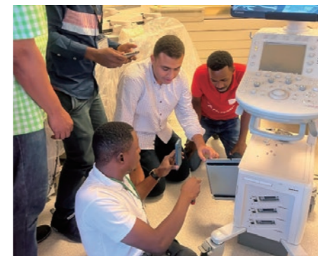
Maintenance and training of ultrasound imaging system in Gabon