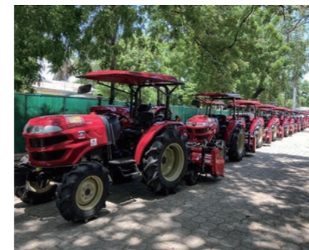
Tractors procured for Haiti