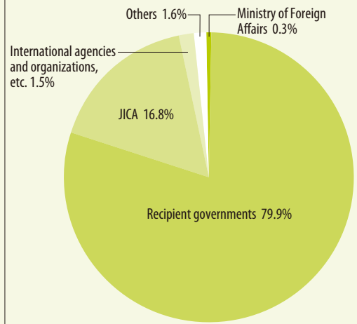
Revenue by Client (FY2012)