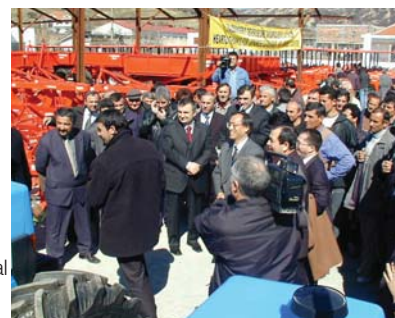
Albania Handover ceremony for agricultural equipment procured by JICS