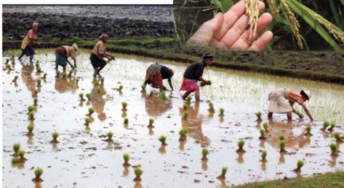
Madagascar Rice planting. Madagascar has the largest per capita rice consumption in the world