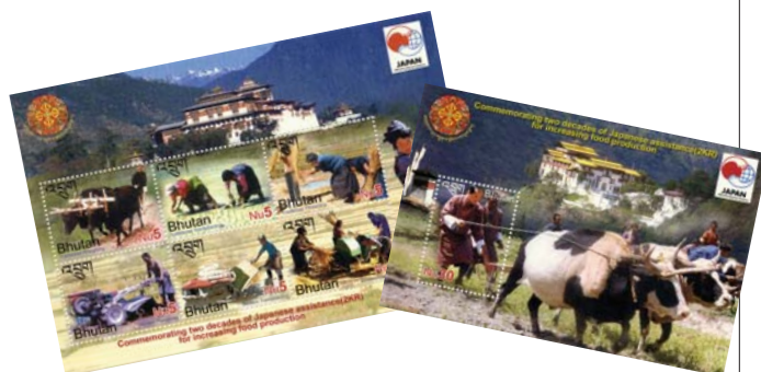
Bhutan Stamps issued to commemorate the 20th anniversary of grant aid for increase of food production (2KR) to Bhutan