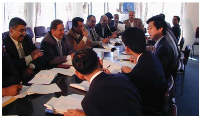
Yemen Committee composed of Yemen and Japanese government officials