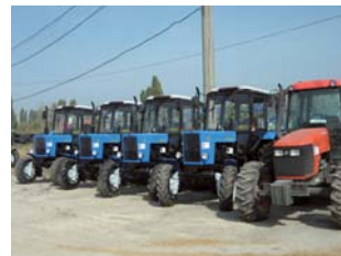
Tractors procured by JICS

First, a cumulative total of 296 tractors procured and delivered were sold within the country, and based on the proceeds of those sales, additional tractors were procured and sold. By repeating the process of procurement and sales, 1,700 tractors, about six times the original number of tractors procured, and a total of 2,135 pieces of agricultural machinery, including combines, had been procured by 2005.