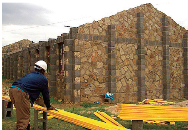
Lesotho Building a school