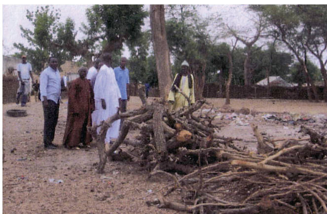
Senegal Temporary classrooms made from broken branches and other materials. During summer vacation, they are disassembled