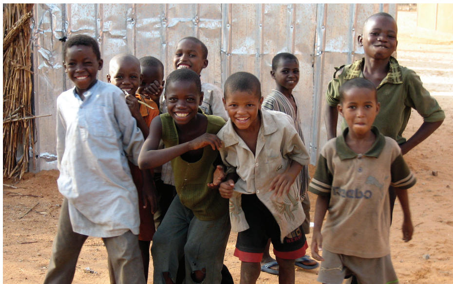
Niger Children at a community empowerment project site

Since fiscal 2006, when this grant aid program began, JICS has conducted procurement management of this assistance, based on contracts with the governments of developing countries. Grant aid for community empowerment makes it possible to carry out assistance flexibly in accordance with local conditions but also demands attention to quality, thus requiring strong procurement management capabilities. As a procurement management agency, JICS supports the smooth and effective implementation of this grant aid.