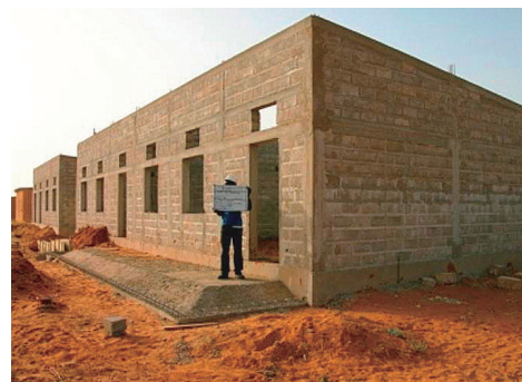
Constructing a school (Completion of wall construction)

However, since executing the plan had met with financial problems, the Japanese government decided to provide Senegal with the Grant Aid for Community Empowerment. The Grant will be used to construct 314 classrooms, 56 (maximum figures) headmaster offices, and 288 toilet buildings for 68 elementary and junior high schools in the five Regions of Kaolack, Louga, Fatick, Dakar, and Thies in Western Senegal, and makes it possible to improve the learning environment of 16,000 school children.