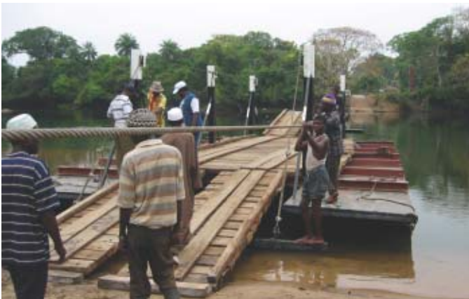
Sierra Leone Boats were repaired, making it possible to transport people and goods again

Since FY2002, in accordance with contracts with developing countries' governments, JICS has been serving as a procurement management agent, managing funds and overseeing and supporting activities appropriate to various program formats.