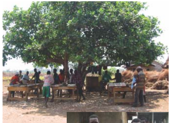
Sierra Leone A vocational training class. Many of the students are former soldiers