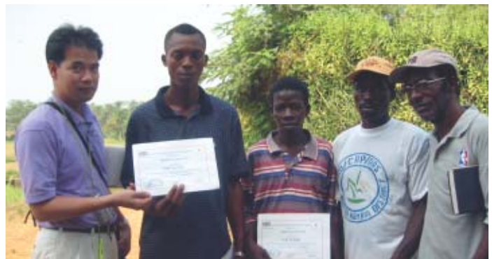
Students holding their course completion certificates, whose design includes the Japanese and British flags