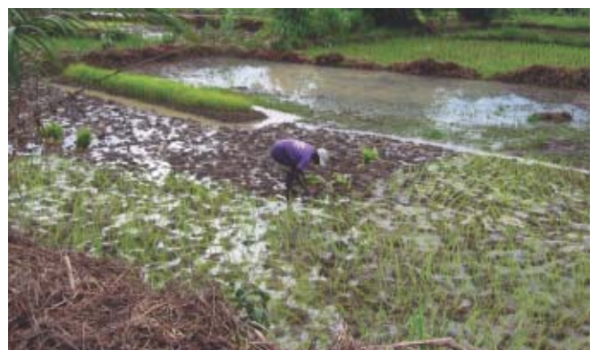
Sierra Leone Repairs to water channels made it possible to flood paddy fields and fill ponds at fish farms