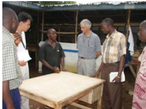
A vocational school student describing a table he made to JICS staff (left) and British aid personnel (right)

At the time of the first inspection trip, few citizens were aware that Japan was participating in the project, but by the time of the second trip, people in most regions knew about Japan's contributions. More people were out and about and street vendors were more numerous, indications that support for the program has contributed to rehabilitating local communities and helped ensure stability in daily life.