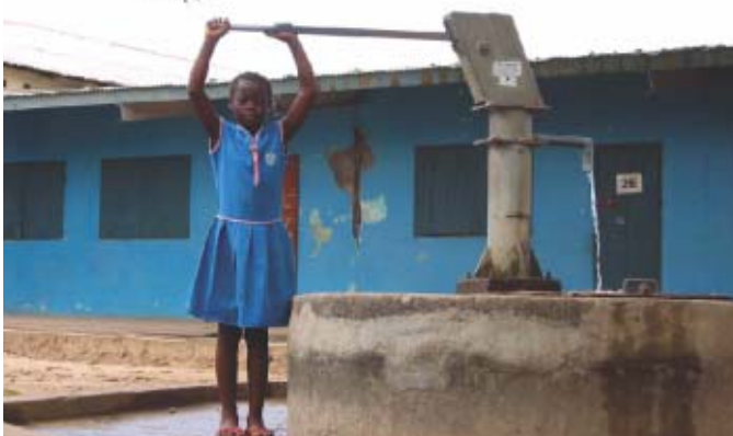
Sierra Leone A young girl pumping water from a well installed as part of support activities