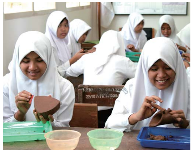
Indonesia Children studying at reconstructed Pleret No. 2 Junior High School