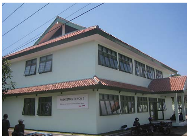
The new Sewon No. 2 Health Center

schools and health centers through the Grant Aid for Disaster Prevention and Reconstruction, and the transition was seamless. The experiences of JICS staff in reconstruction assistance for Afghanistan and disaster assistance in the Indian Ocean tsunami were very useful in this operation.