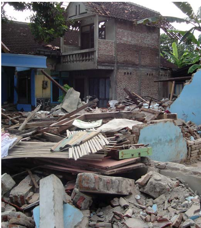
Indonesia A building damaged in the earthquake that struck central Java

Since fiscal 2006, when this grant aid program began, JICS has been mainly involved in managing implementation of projects for reconstruction after natural disasters. While grant aid for disaster prevention and reconstruction is needed quickly, many structures and facilities are in need of reconstruction, and therefore strong procurement management expertise and knowledge of many different areas are needed. As a procurement management agency, JICS supports the smooth and effective implementation of grant aid.