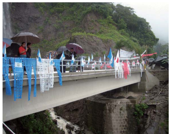
Guatemala Opening ceremony for the rebuilt Barrancas Bridge damaged during Hurricane Stan